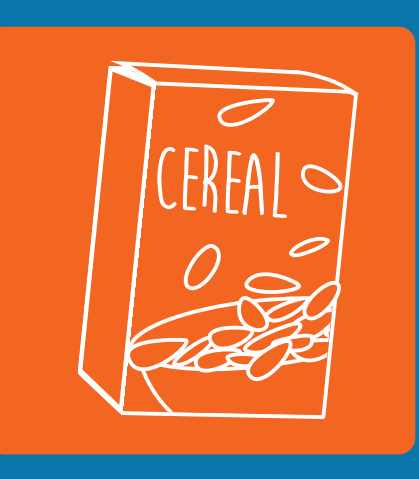
BREAKFAST FOOD + UHT MILK