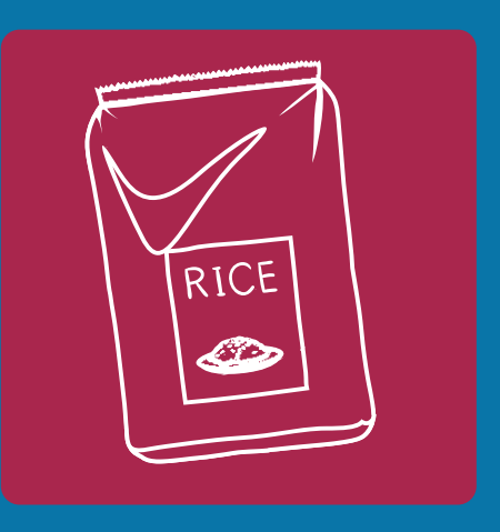
PASTA/RICE + QUICK MEALS