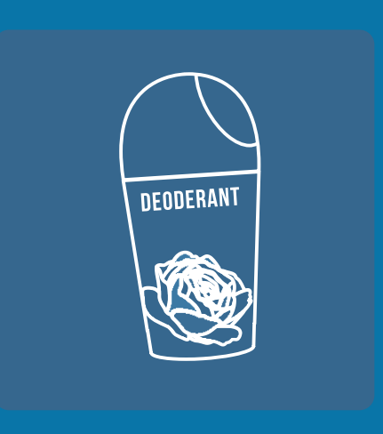
TINNED FOOD WOMEN'S NEEDS