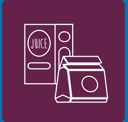
SCHOOL LUNCH SPREADS/SNACKS